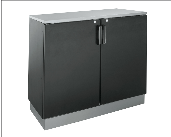
BR48L-BSB-LR SHOWN with OPTIONAL 1" TOP and KICK PLATES