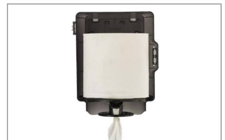
Dispenses most grades of paper