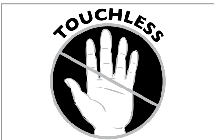
Hygienic touchless dispensing