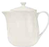
16 oz. Tea Pot w/Lid No. POT-13 Ultra Bright White H5¼ (including lid) T4¾ D6¼ 1 doz./16# • 1.2 cu. ft.