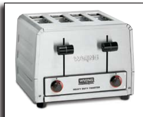
WCT820 Bagel Toaster