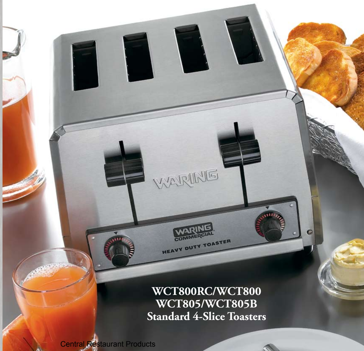
WCT800RC/WCT800 WCT805/WCT805B Standard 4-Slice Toasters