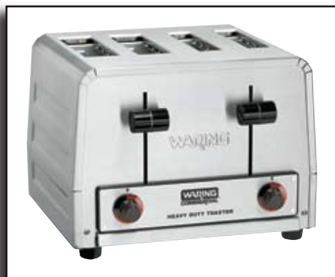
WCT810/WCT815/WCT815B Combination Toasters