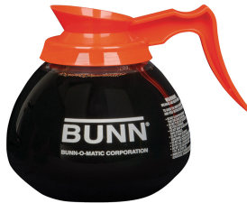
DECANTER, GLASS-ORN 12C 3/CS