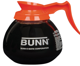
DECANTER, GLASS- ORN 12 CUP 1PK