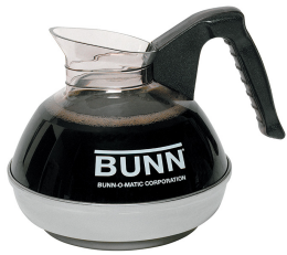
EASY POUR,(BLK) 6/CS