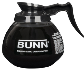
DECANTER, GLASS-BLK 12C 3/CS