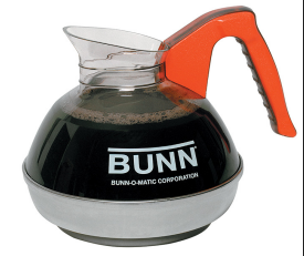
EASY POUR,(ORN) 6/CS