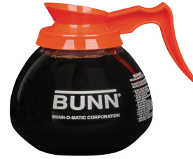
DECANTER, GLASS-ORN 12C 3/CS