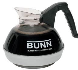
EASY POUR,(BLK) 12/CS