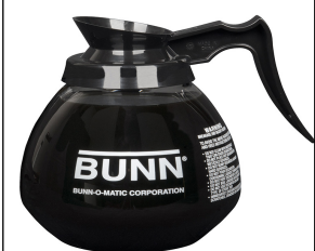
DECANTER,GLASS-BLK 12CUP 1PK