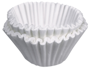
FILTERS,REGULAR1M 500/2 50/CL