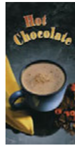
Model FMD-1 available with optional Hot Chocolate Display