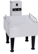
1SH STAND, 120V