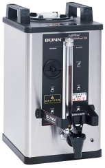
SH SERVER, 1.5G/5.7L 240 MIN ADJ TMR