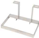
BRACKET WLDMT, DRIP TRAY RWS1