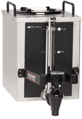
1.5GPR-FF, TOP HNDL