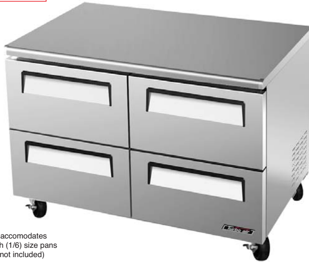
- Each drawer accommodates up to 6" deep sixth (1/6) size pans (drawer pans not included)