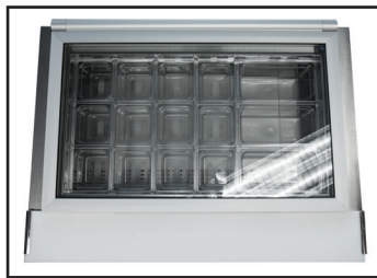
Glass Lid Top

This product is equipped with a fine mesh filter to the front of the condenser to catch dust, and a rotating brush that moves up and down daily to remove excess buildup outward and away.