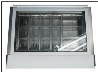
Glass Lid Top

This product is equipped with a fine mesh filter to the front of the condenser to catch dust, and a rotating brush that moves up and down daily to remove excess buildup outward and away.