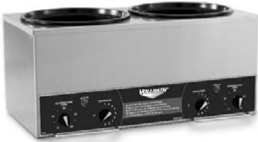
Twin 7 Quart Rethermalizer