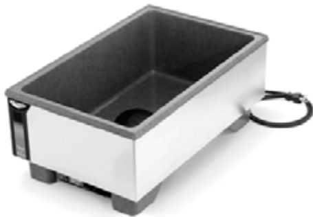
Model 1220 Full-Size Heat 'N Serve Merchandiser