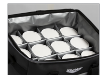
Shown with 12 compartment divider