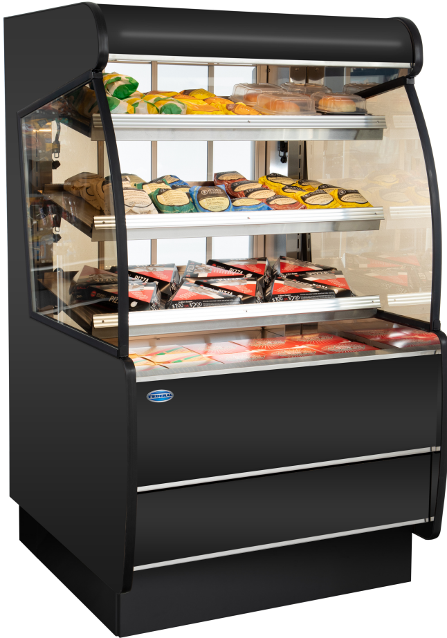
Model HSSM360 Shown with custom rear sliding doors, LED lights below shelves and reflective end glass

Designed for customers looking to increase grab and go sales of hot packaged products or to complement refrigerated offering.