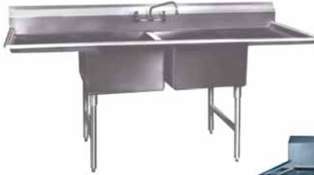
Double Tub Sink w/ 2 Drainboards

1L 18 Number, Location & Size of Drain Board