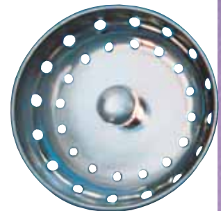
Basket Drains for all Sinks