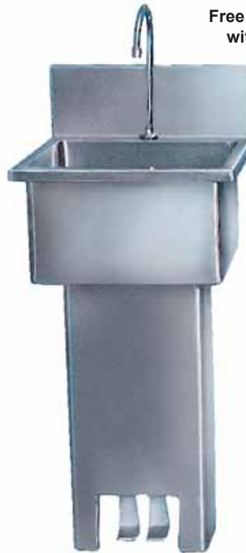
Free Standing Sink with Foot Pedals WHPS1616