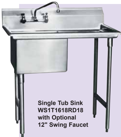
Single Tub Sink WS1T1618RD18 with Optional 12" Swing Faucet

For preparation and processing in all Food Service environments.