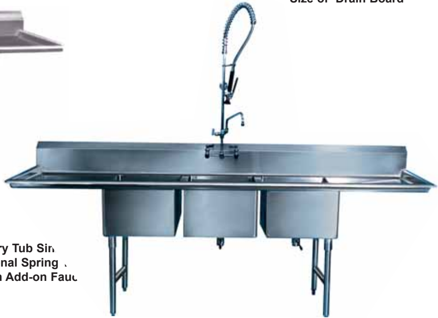
Triple Bakery Tub Sin. Optional Spring Pre-Rinse with Add-on Fauc.