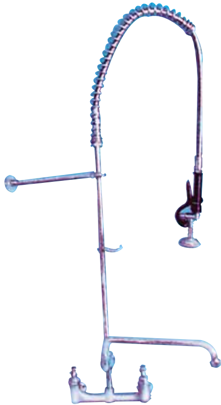
Spring Type Pre-Rinse Unit with Wall Bracket (WS-SPR-ST) and optional 14\"/>

All Win-Holt sink accessories are chrome plated brass, and they are NSF approved.