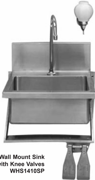
Wall Mount Sink with Knee Valves WHS1410SP