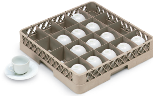
TR5 20-COMPARTMENT 3 3/16" (9 cm) x 4 7/16" (11.3 cm) sq. compartment Diagonal 5 3/16" (14.3 cm)