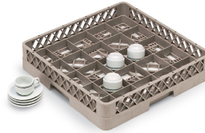
TR16 25-COMPARTMENT 3 7/16" (9 cm) sq. compartment 4 15/16" (12.5 cm) diagonal