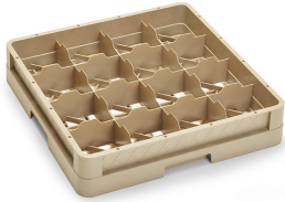
CR4 16-COMPARTMENT 4 7/16" (11.3 cm) sq. compartment 6 1/16" (15.4 cm) diagonal