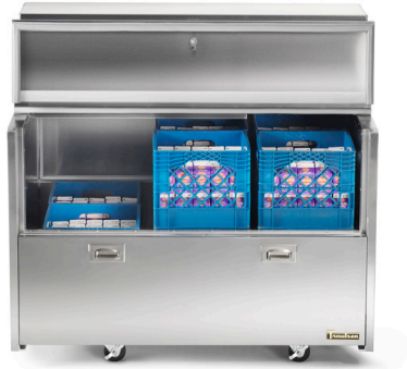
Model Shown - RMC49D4