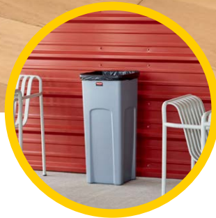
DURABLE, LONG-LASTING SOLUTION

Cinch secures liner around the rim of the container and allow for quick, knot free liner changes