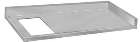
5" BACKSPLASH VCTF Series (Shown with optional side splash and cut-out)