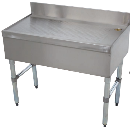
CRD Series 21" Wide Units