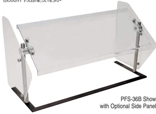
PFS-36B Shown with Optional Side Panels