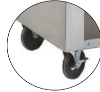
Optional TA-255P Casters Available