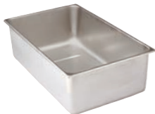
SP-A - Spillage Pan

Visit our website for additional Food Table Accessories