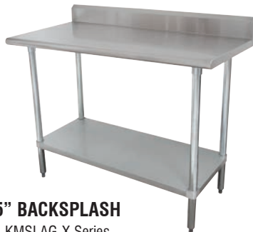
5" BACKSPASH KMSLAG-X Series