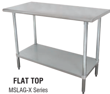
FLAT TOP MSLAG-X Series

LEGS: 1 5/8" diameter tubular Stainless steel. Stainless steel gussets. 1" adjustable stainless steel bullet feet.