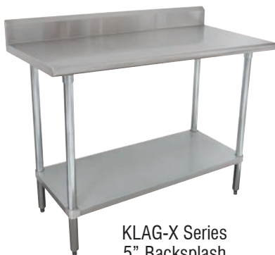
KLAG-X Series 5" Backsplash