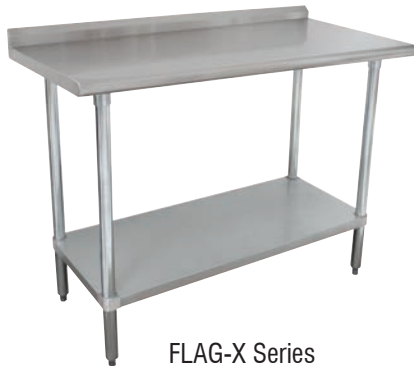
FLAG-X Series 1 1/2" Backsplash