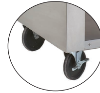
Optional TA-255P Casters Available