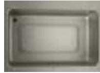
Sealed Well with Drain