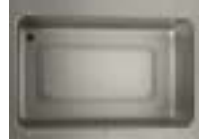
Sealed Well with Drain