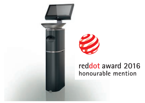
MC 500 stand-alone model

The 15.6" color touch display offers shoppers clarity plus optimum comfort and convenience of use: in terms of intuitive product selection, transparent provision of information about the food products and the display of advertisements and promotional videos in brilliant image quality. To keep the MC 500 continuously available for service, the optional PaperNearEnd function issues a timely alert when the paper in the printer is running out. The storage space integrated in the stand facilitates fast and simple replacement of the label rolls. The rolls, along with cleaning agents, can be comfortably stored in the space provided and are accessible from both sides. Time can also be saved during the daily cleaning activities thanks to the Easy Clean housing.