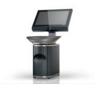
MC 500 table-top model