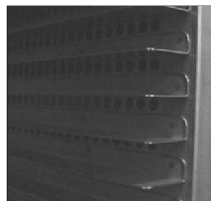
Optional fixed angle slides