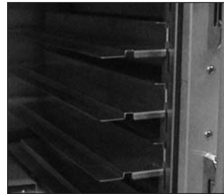
Optional stainless steel adjustable universal slides