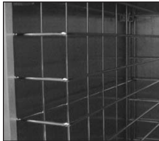
Standard universal wire slides

PAN SLIDES... Universal wire slides at fixed spacing of 3". Assemblies removable. Hold 18"x26" sheet pans, 12"x20" steam table pans, 2/1 or 1/2 G/N pans. Adjustable universal stainless steel pan slides or fixed angle slides are optional.