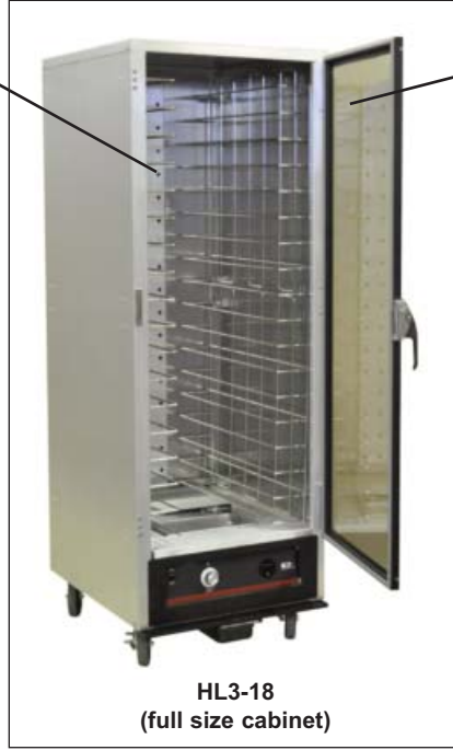
HL3-18 (full size cabinet)

FOUR SIZES... HL3 series cabinets are available in under-counter, 1/2 size, 3/4 size and full size.