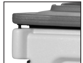
Durable aluminum hinge pins & nylon clips can be easily removed for cleaning.