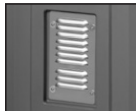
Two non-insulating, aluminum louvered vents on the back