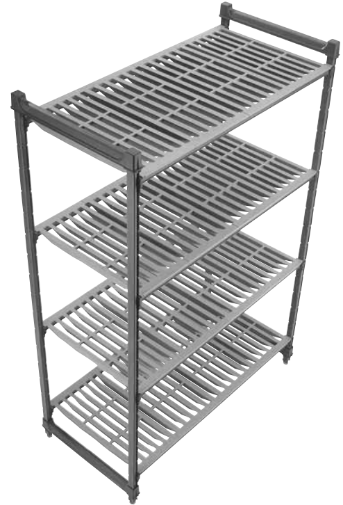
Four Shelf Unit with Vented Shelf Plates.