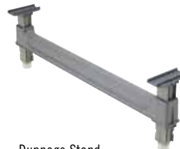
Dunnage Stand Recommended for Units 54" (1380 mm) or longer.