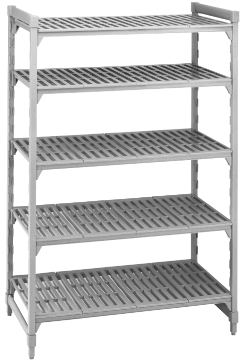
Five Shelf Starter Unit consists of two Post Kits and five Vented Shelf Kits.