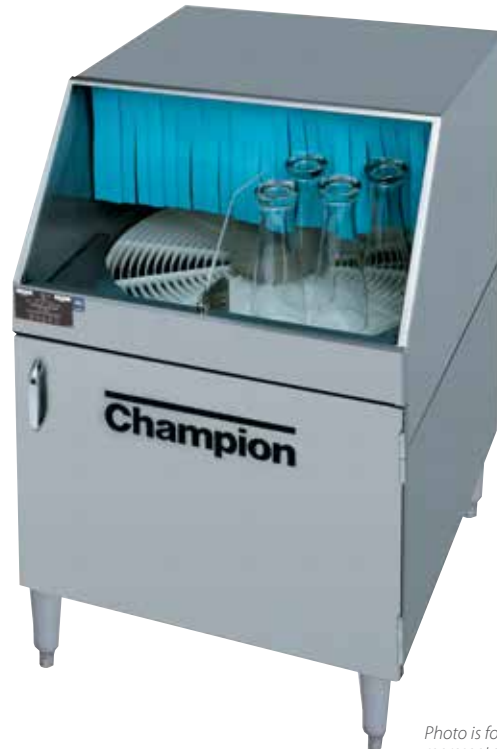
Photo is for general visual representation only. Please refer to specifications for the latest detailed product information.