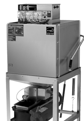
MODEL EST-AH-EXT (Tall) (20-1/2" DISH CLEARANCE)