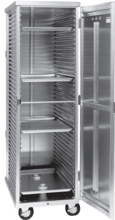
102-ST-1841E (Pans not included)