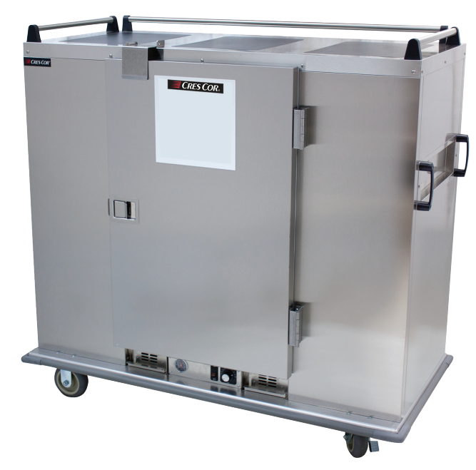
EB-120 (Shown with accessory options)