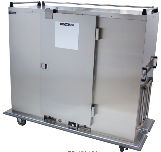
EB-150-XX (Shown with accessory options)