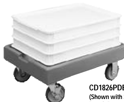
CD1826PDB (Shown with 3 each stacked Pizza Dough Boxes Product #DB18263CW)