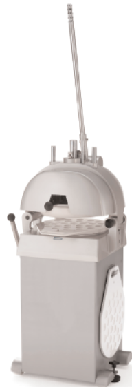
DSA315I - DSA322I DSA330I - DSA336I