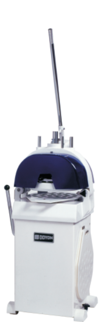
DSA315 - DSA322 DSA330 - DSA336

“Superior quality product at an affordable price !”