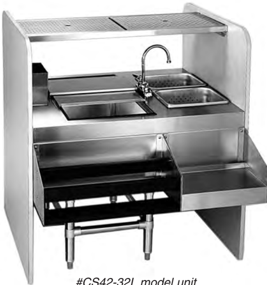
#CS42-32L model unit

Eagle Spec-Bar® Cocktail Station, model _____. Heavy gauge type 304 stainless steel body, legs, leg channels and cross rails with plastic laminate-covered wooden end panels (color to be determined). Two stainless steel deep-drawn sinks with stainless steel perforated lift out baskets, T&S gooseneck faucet, stainless steel blender shelf, stainless steel double speed rail with ABS for sound deadening, foamed-in-place stainless steel ice chest with sealed-in 8-circuit post mix cold plate, 4" x 8" x 6½"-high tubing chase. Stainless steel overshelf with removable stainless steel perforated inserts.