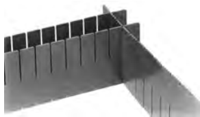
tote box dividers