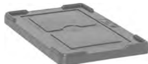
tote box cover (for TB1016 and TB1722 series)