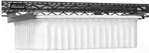
adjustable undershelf slides with tote box