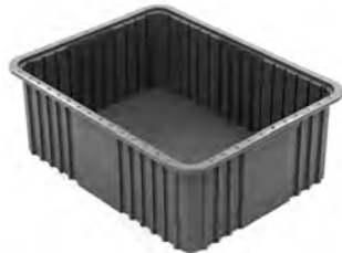
TB1016 and TB1722 series

*Model #A208513 lid fits models A208506, A208507, and A208508 stacking boxes.