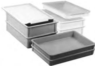
assorted molded fiberglass boxes and trays