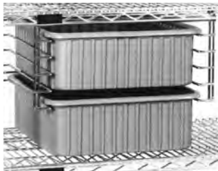
slide system with tote boxes