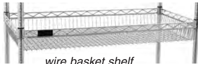
wire basket shelf