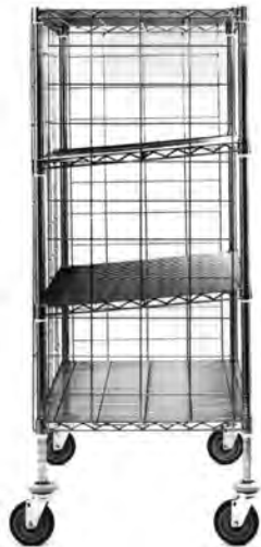
mobile unit with optional slanted shelves