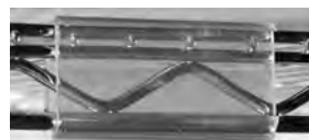
clear plastic label holder for reverse mat shelves