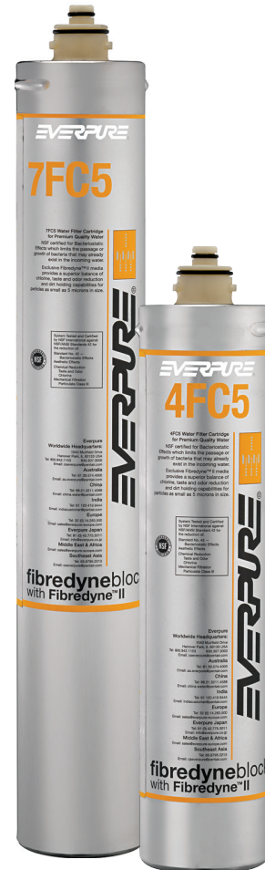
4FC5 Replacement Cartridge 1 PK: EV9693-21 7FC5 Replacement Cartridge 1 PK: EV9693-61

Always flush the filter cartridge at time of installation and cartridge change.