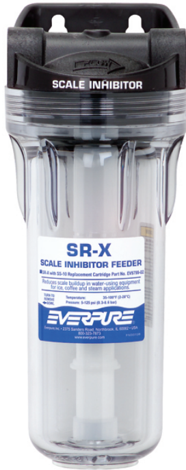
SRX Feeder: EV9798-45

Superior scale prevention and corrosion control