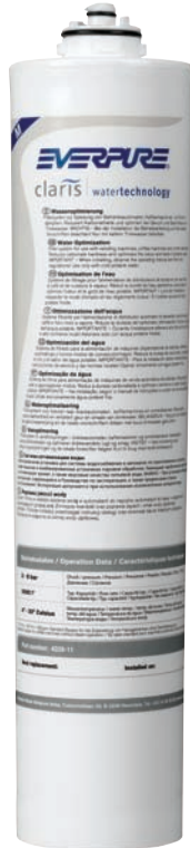
Clariss Medium Cartridge: EV4339-11

Adjustable ion-selective filters to tailor carbonate hardness levels in potable water