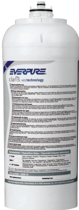
Claris Large Cartridge: EV4339-12

Adjustable ion-selective filters to tailor carbonate hardness levels in potable water