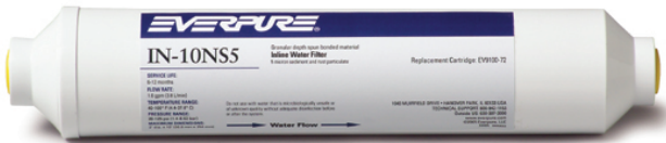
IN-10 NS5: EV9100-72